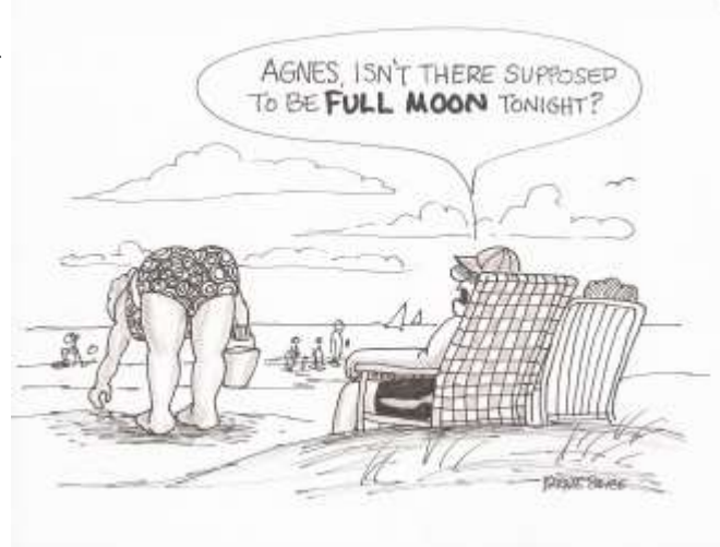
Cartoon courtesy of Barnie Slice

Last summer on Sunday mornings from 10-2 on the deck we launched an educational program called TURTLE TALK. Visitors and locals alike were very interested in learning about the Loggerhead Turtle's journey and the role proper care of our beach plays in a successful nesting season. Please stop by and chat with the SCUTE volunteers! We hope to continue the program when the deck reopens. Visit SCUTE on face book.