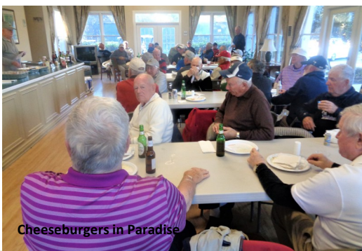
Cheeseburgers in Paradise