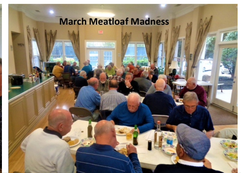
March Meatloaf Madness