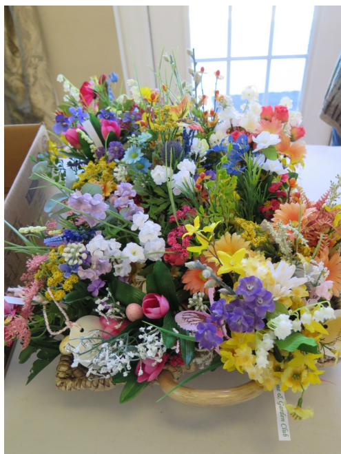
Silk flower arrangements for the Lakes of Litchfield