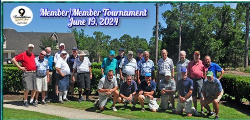
Member/Member Tournament June 19, 2024

June 19 th , we played our 8 th Annual Member/Member Tournament. It is two-man match play with the round having three holes each on Better Ball, Alternate Shot and Captain's Choice.